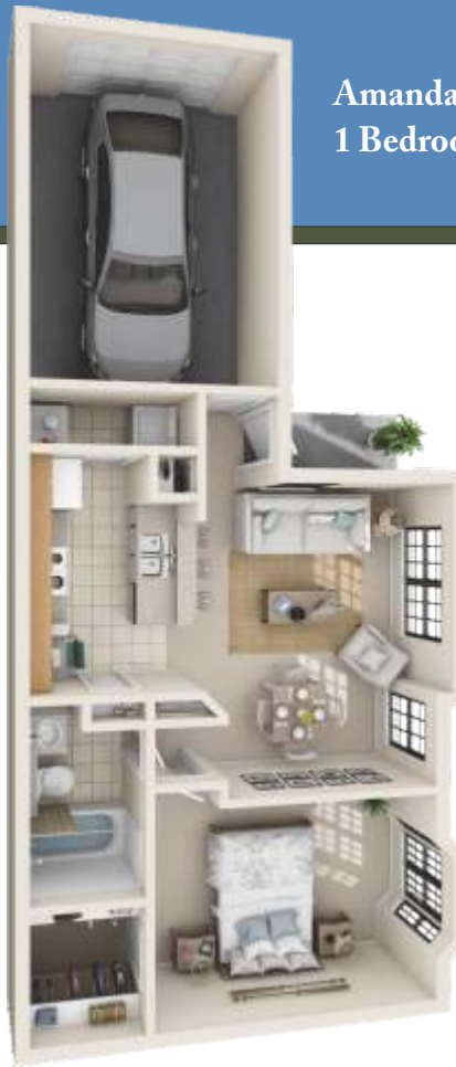
Amanda - A2 734 Sq. Ft. 1 Bedroom / 1 Bath