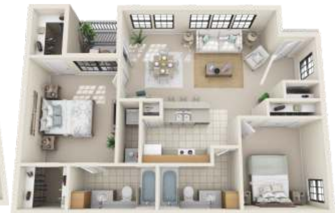
Bridget- B1 988 Sq. Ft. 2 Bedroom / 2 Bath