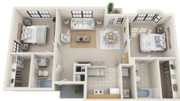
Bally - B3 898 Sq. Ft. 2 Bedroom / 2 Bath