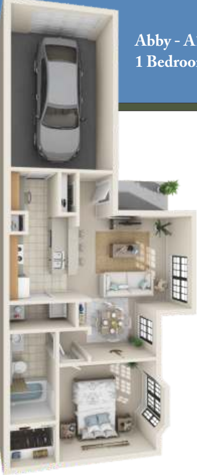
Abby - A1 672 Sq. Ft. 1 Bedroom / 1 Bath